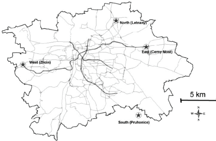
Figure 1: Prague's Four Major Suburban Retail Locations

development in other sectors, there were no clear confounding factors. In autumn 2001, the author led a surveying effort of shoppers at the four main new retailing sites at the compass points of the Prague periphery shown in Figure 1.